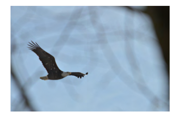
Accompanying text excerpted from the New York Times article by Sara Ruberg 12/16/24

Bald eagles frequent the Dune Acres area. There have been recent sightings of two adult eagles near the beach.