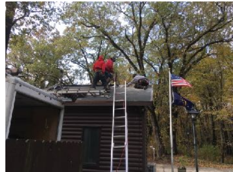
The windy weather (note the flags in the photo!) and occasional rain shower didn't keep the folks from Rogers Roofing inside . . . the roofing construction went on as planned!

The Dune Acres Town Council is pleased to announce receipt of an Indiana Office of Energy Development Grant that will assist with the purchase of an alternative energy vehicle for our security staff.