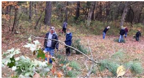
Residents drag branches and tree trunks to the roadside for later pickup.

It is hard to imagine a “town cleanup day” being the “social event of 2020” . . . but after months of lockdown with no gatherings of any sort, the October 17 th Dune Acres annual fall event brought out a host of neighbors and friends to spruce up areas throughout the community.